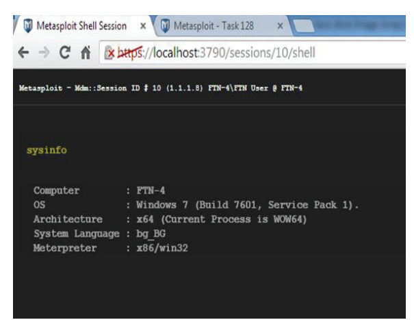
Fig.4. The executed command "sysinfo" on the target machine

From fig.4 there could be seen that the computer name was "FTN-4", operating system was "Windows 7 (Build 7601, Service Pack 1), architecture was "x64 (Current Process is WOW64), system language was "bg_BG" and payload type (Meterpreter) is "x86/win32".