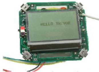
Fig. 2. LCD module

network. This device consists of a Mica-2 integrated with an LCD capable of displaying text and simple graphics and four control buttons. These buttons can be used to activate the wake-up module from "Deep sleep" and also allow the user to enter text. These devices provide an easy and inexpensive way to spread the screen and the user to interact with information in the workplace [1, 3].