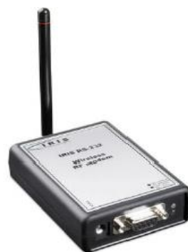
Fig. 3. Portable module

Although suitable for limited interactions, handheld devices such as PDAs and laptops can provide a sophisticated user interface and tools for analyzing data for humans as well. CANBY (Fig. 3) is a compact flash card format is the reason for the Mica-2 mote by allowing pockets and laptops to easily interact with sensor networks. These devices can be used as part of a field tool. Example Field tool Task allows it to be manually used to interrogators near the person by sending "ping" messages to the corresponding module. In some working applications, the GUIs of the handheld module have been used to provide information from sensors that are close to the person.