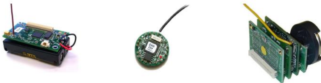
Fig. 1. Sensor modules

The particle is a sensor with a widely applicable platform that combines sensitivity, computation and communication. The particles are usually low cost, small, battery powered devices that are designed to be able to place large-scale sensors in the environment. An example of Berkeley (Fig. 1), which is commonly used in the sensor network for the study and application of Mica-2. The Mica-2 mote is designed using components and includes an input-output connector to provide stacked platforms for effective integration with sensors and alternative communication boards for experiment [3, 4].