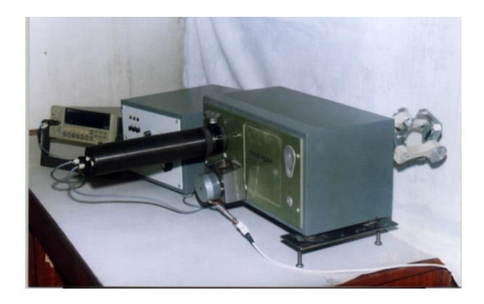
Fig. 2. satellite optoelectronic spectrophotometer for research of the total content of the atmospheric ozone

channel is performed at closed lightprotecting blend 2